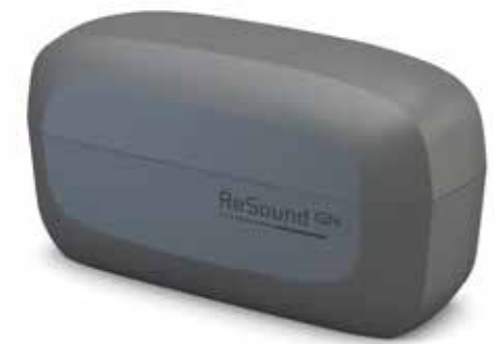
Standard charger C-2