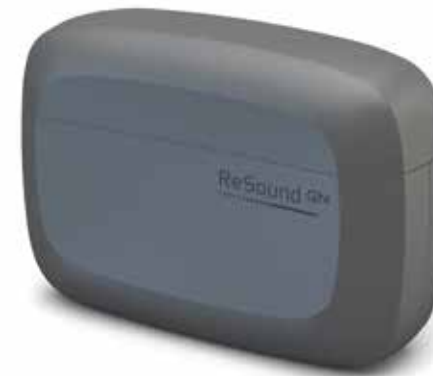
Premium charger C-1