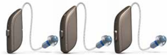
RT61-DRW RT61-DRWC RT62-DRW