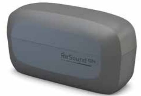
Standard charger C-2