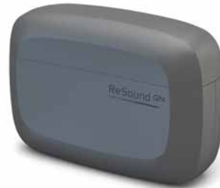
Premium charger C-1